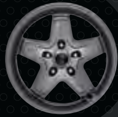
** DARK ARGENT [P5155982]