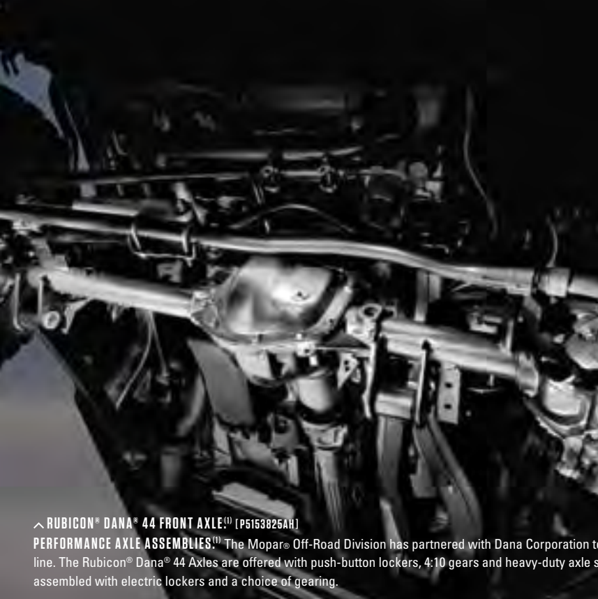
^ RUBICON® DANA® 44 FRONT AXLE (1) [P5153825AH]

PERFORMANCE AXLE ASSEMBLIES (1) The Mopar® Off-Road Division has partnered with Dana Corporation to offer incredibly strong complete axle sets now available through the Jeep® Performance Parts line. The Rubicon® Dana® 44 Axles are offered with push-button lockers, 4:10 gears and heavy-duty axle shafts. For the ultimate in strength, all-new Dana 60 Axles are also available. These axles are fully assembled with electric lockers and a choice of gearing.