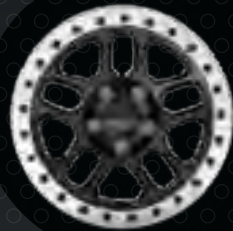
BEADLOCK (See part numbers below)

These custom wheels are machined to match your Wrangler's exact specifications. The design helps deliver a smooth and balanced ride.