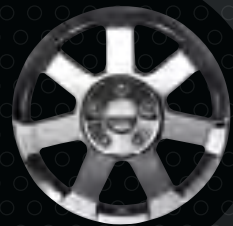
PREMIUM CHROME [82210001]

BEADLOCK WHEELS (Shown above and at right). Our functional Beadlock Wheels deliver an aggressive look with a bolt-on outer beadlock ring standard. This feature allows off-road vehicle operation with low tire pressures for maximum traction. Features the proper 12mm offset to run a 35-inch tire with a 2-inch lift. Wheel also features a standard cast-in outer tire bead for normal DOT-approved tire mounting if desired. A non-functional trim ring is also available if desired. Satin Black wheel with Silver painted forged beadlock. Size: 17 inches x 8.5 inches. [77072326AB – Wheel w/Beadlock Ring] [P5160052 – Beadlock Ring, sold separately] [82215111AB – Trim Ring, sold separately]