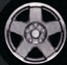
17-INCH HULK [82210355AB]