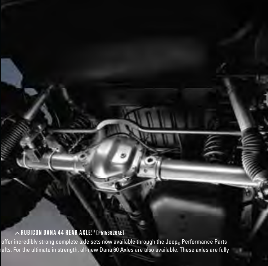
^ RUBICON DANA 44 REAR AXLE (1) [P5153826AE]

PERFORMANCE AXLE ASSEMBLIES (1) The Mopar® Off-Road Division has partnered with Dana Corporation to offer incredibly strong complete axle sets now available through the Jeep® Performance Parts line. The Rubicon® Dana® 44 Axles are offered with push-button lockers, 4:10 gears and heavy-duty axle shafts. For the ultimate in strength, all-new Dana 60 Axles are also available. These axles are fully assembled with electric lockers and a choice of gearing.