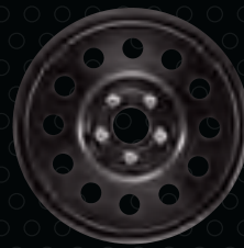
17-INCH WINTER/OFF-ROAD [52124455AB]