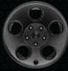
* SATIN BLACK [P5155978]