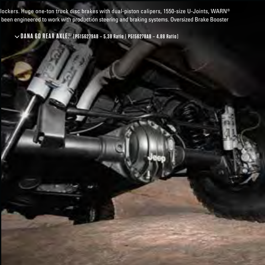
^ DANA 60 REAR AXLE (1) [P5156279AB – 5.38 Ratio | P5156278AB – 4.88 Ratio]